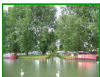
Feasibility study on footbridge over river