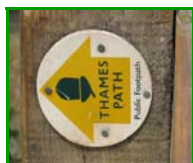
Production of Walks booklet