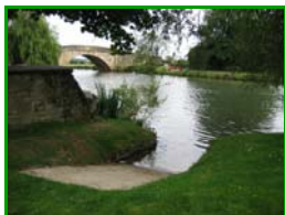
Slipway at Free Wharf