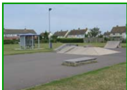
Skateboard park and youth shelter

The following are examples of what can be achieved by enthusiasm and effort by groups of people: