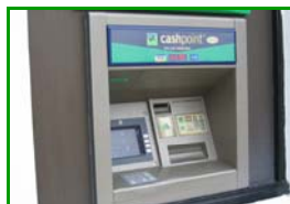
Provision of Cashpoint facility

Here are some of the projects highlighted by the recent community plan and already being acted upon: