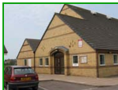
New Memorial Hall