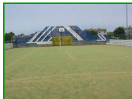
All weather court