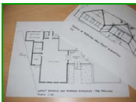
Youth and Community building