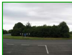
Improve appearance of roundabouts