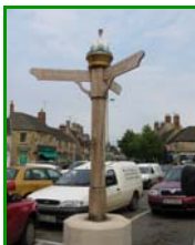
Market Square Sign